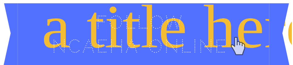
Right: NCAEHA's newly redesigned website. Bookmark us at: www.ncaeha.com