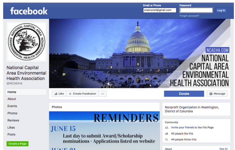
Left: NCAEHA's new social media presence on Facebook. Follow us at: www.facebook.com/ncaeha